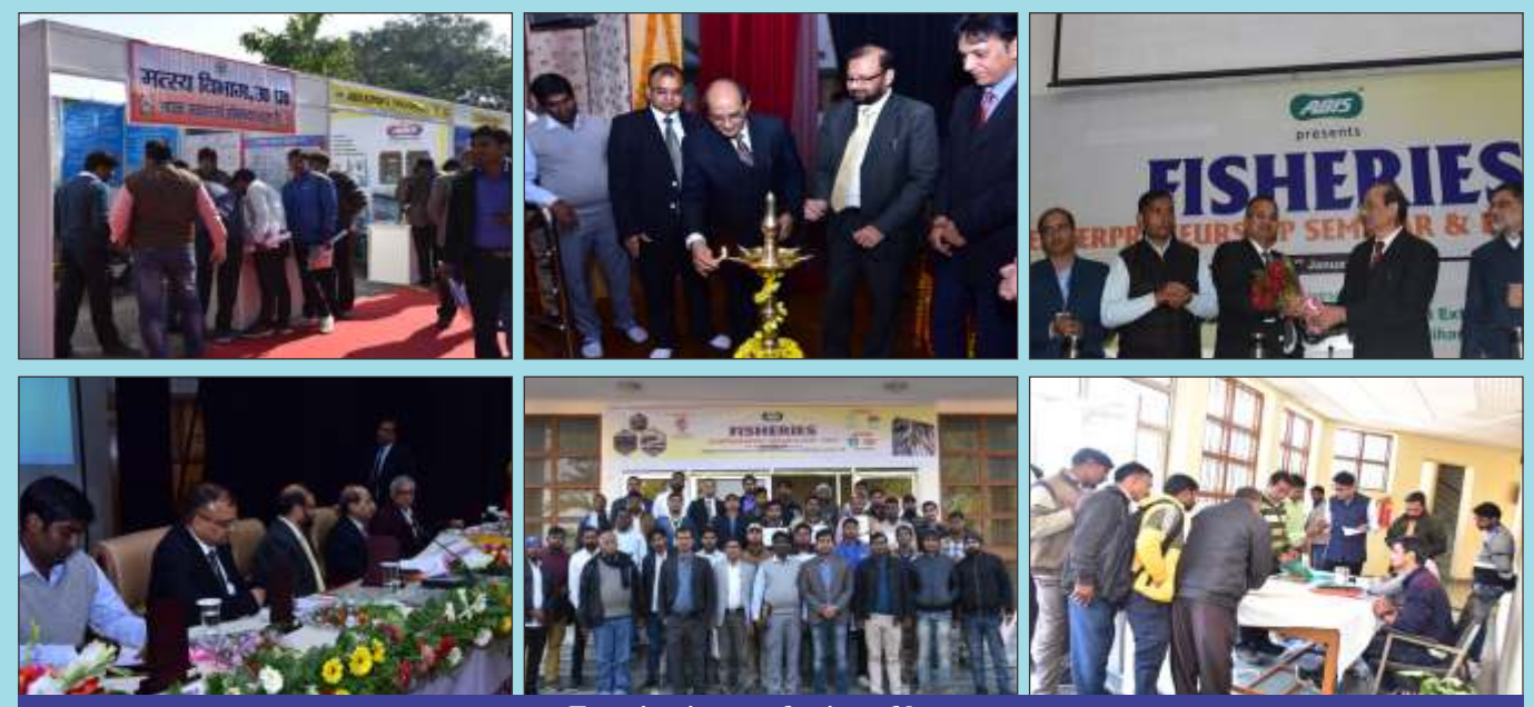
Farming is a profession of hope.

District Fisheries Officers of various districts also shared their experiences with the participating farmers.